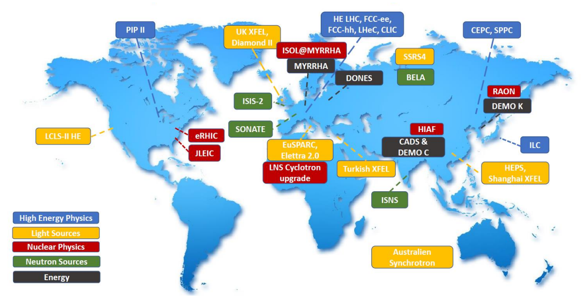
Figure 1: Global Landscape of Future accelerator Projects with their Field of Applications

(see Fig. 1). The timelines, the global costs (when available) and the technology breakdown of these projects are also collected and tabulated.